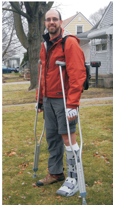
A properly equipped convalescent

I've gotten more use out of some of my outdoor gear since my injury than I did in the previous year! I wonder if REI has considered targeting the convalescent market?