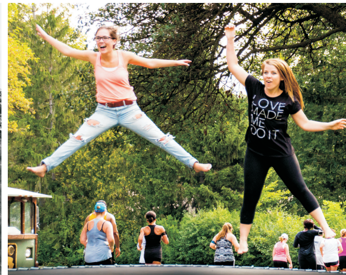
Jeff Grossklaus Photo Contest Winner for Scenery, Black and White, and Action