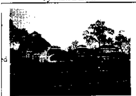
Belle Isle Conservatory and Aquarium