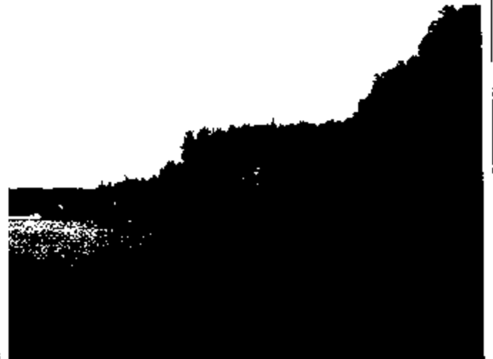
Stacie Kitchen's 4 day trip, stops along the way to Copper Harbor

Left: Photo: Lake Superior near Paradise, MI