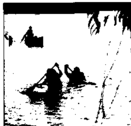
Photo: The lake went a little too soft for some folks at last year's class...

School of Outdoor Leadership, Adventure & Recreation