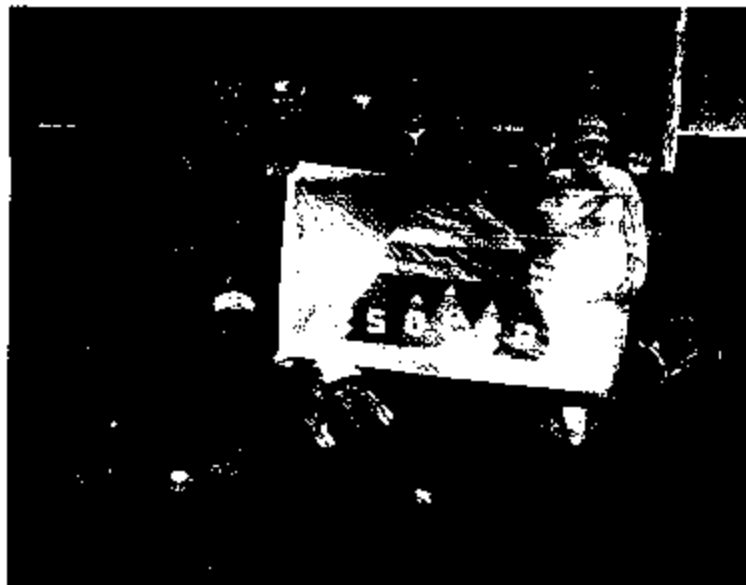
Solar basic backpacking instructors displaying their colors at Hoist Lakes