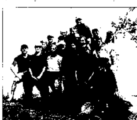
June Kayaking Class: SOLARites and the instructors