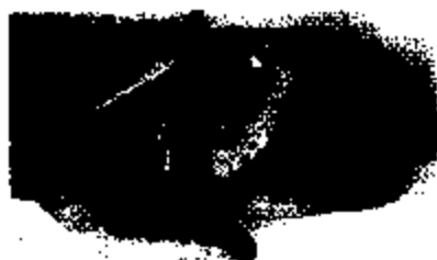
June Archeology Dig: Solarites unearthed lots of neat artifacts from the garbage dump (shown above), including a long, sharpened bone used as a hairpin, a large dog or wolf's tooth with one bone drilled in the end of it, and a large jawbone.