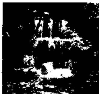
Rock Glen Falls, Ontario 35 Foot Waterfall