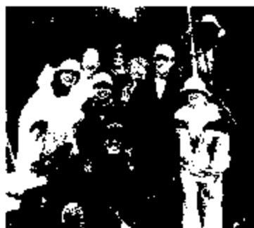
June Archaeology Crew