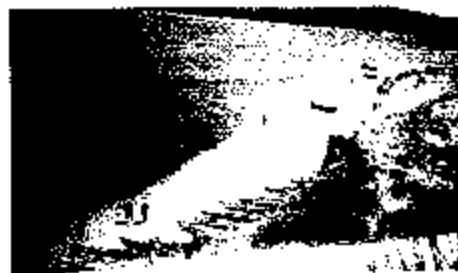
Junior Kayaking Class: Bird's eye view from top of the Silver Lake Dunes

Leslie Cordova - lesliecova@aol.com or (248) 547-5626