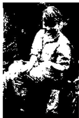
Gloria Fontaine shows off a complete, unbroken bone needed.