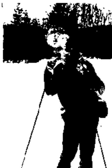
Clayton Lucey savors the race