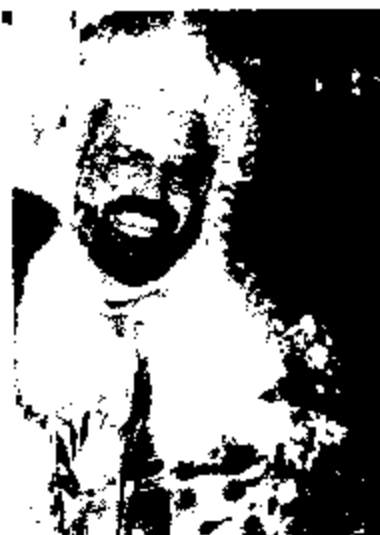
The Prez as Tinkerbell — What kind of club is this?