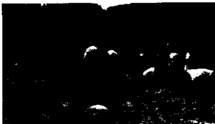
1997 Fossil Hunt and Adventure Day.

Please bring a dish to pass for the Pot-Luck lunch. Chefs and gourmet cooks, do your stuff! After we chow down with fellow SOLARites, off with the clothes (but into bathing suits, please), and onto the waterfalls. Ziplock baggies and waterproof stuff sacks are the key words here. Waterproof cameras are recommended. Mostly everything gets wet here. A bonfire is planned for Saturday night.