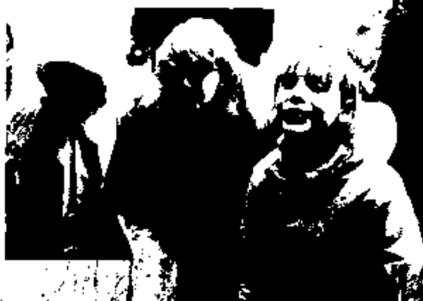
Kids having fun at Hocking Hills...a very Kid-Friendly trip