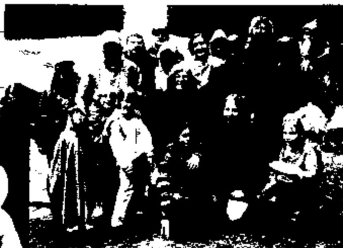
Some of the SOLARites at Cedar Falls