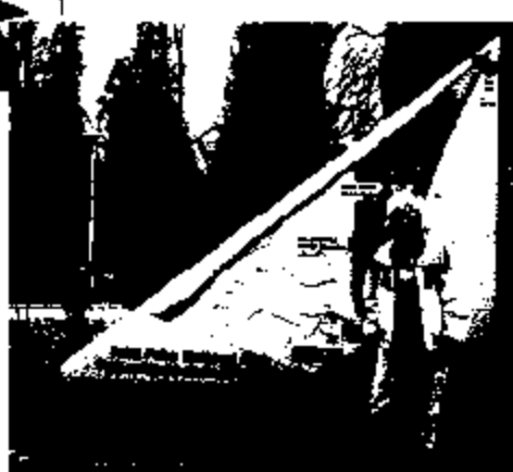
Your SOLAR Ray Editor arrives at Pt. Pelee Saturday afternoon