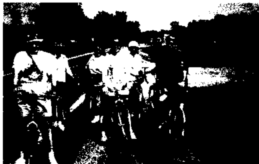
This excited looking group of cyclists is about to depart on the first leg of the North Country Trail as it winds through the State of Michigan. (Note: some are facing the wrong way and are headed to New York).

Day 2 will be on a river to experience what the current will do with your new skills; some light white water will be available (Pray for rain the week before the class) to get some practice getting wet. For more information, call Doug Lanyk at (810) 634-4551. Let's hit the water! Yea!!